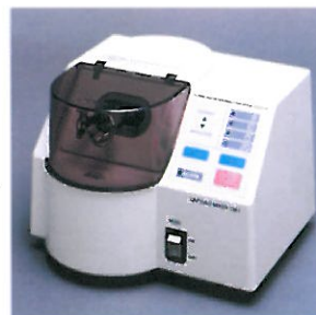
CAPSULE MIXER CM-I

For best mixing results, the GC CAPSULE MIXER CM-I is recommended for mixing the GC Miracle Mix CAPSULE.