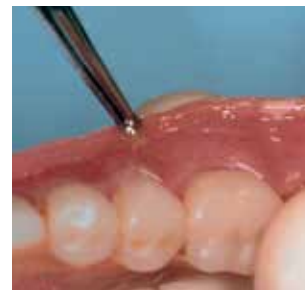
For optimal smoothness, apply mixed GC RELINE MODIFIER A & B