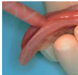
Apply GC RELINE (Extra) Soft. Working time is 2 mins at 23°C