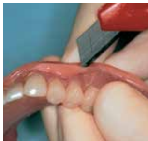
Trim excess with an appropriate instrument