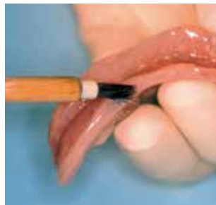
Apply GC RELINE Primer and gently dry