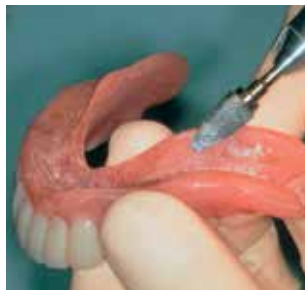
Relieve the area to be relined