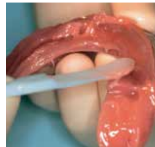
Distribute over the denture with a spatula