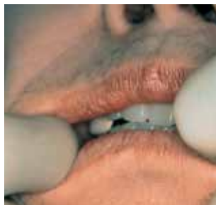
Seat denture in mouth and muscle trim. Retain in situ for 5 mins