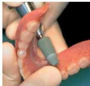
Finish with a GC RELINE SILICONE POINT (< 10,000 RPM)