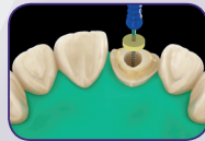
Measure the length needed