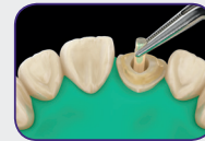
Fit the post inside the root canal