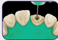
Prepare the space for the post