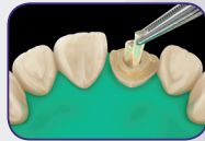
Fill the canal with shorter posts if needed, and condense them laterally