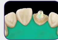
Continue the build-up with composite & light-cure