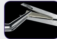
Taper the post if necessary