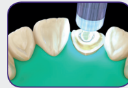
Light-cure for at least 40 seconds