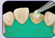
Insert the condensed post into the canal