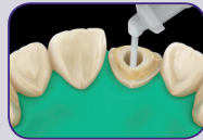
Use a dual-cure composite luting for the cementation