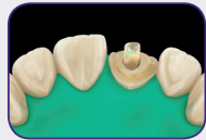
Place the post inside the root canal